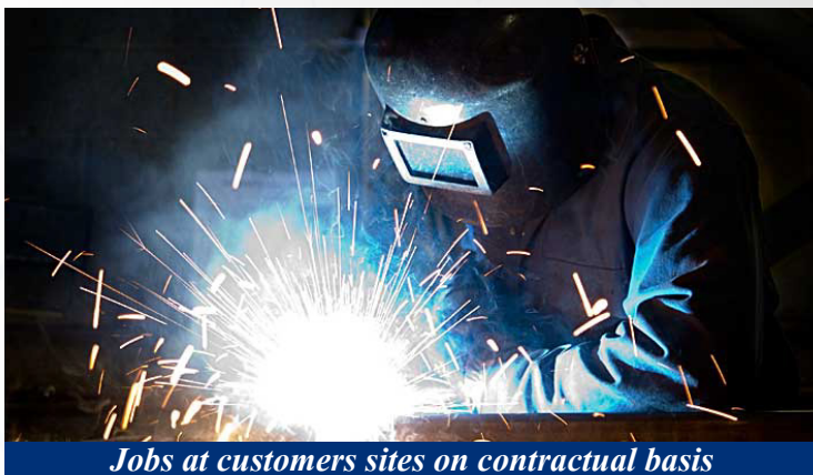
Jobs at customers sites on contractual basis

Strong industrial relations with our work force.