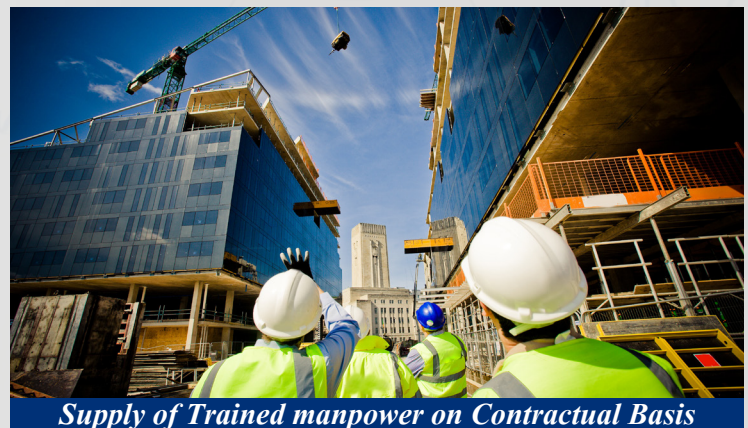
Supply of Trained manpower on Contractual Basis