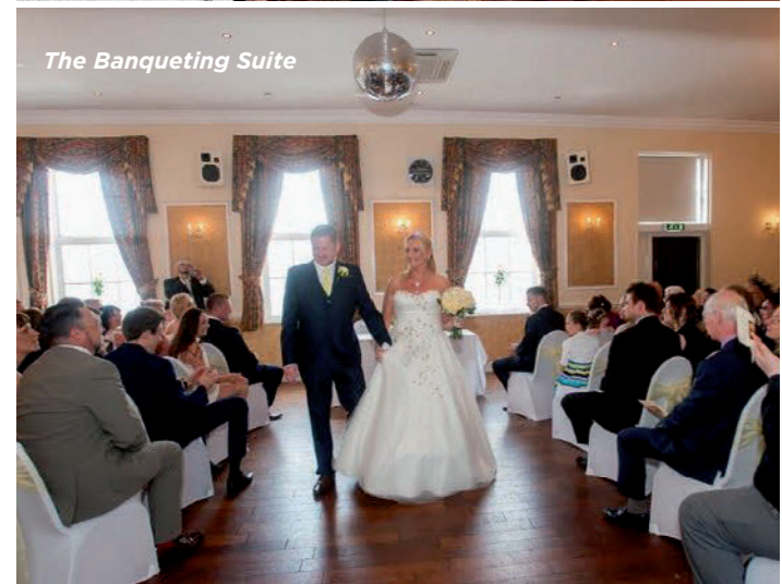
The Banqueting Suite