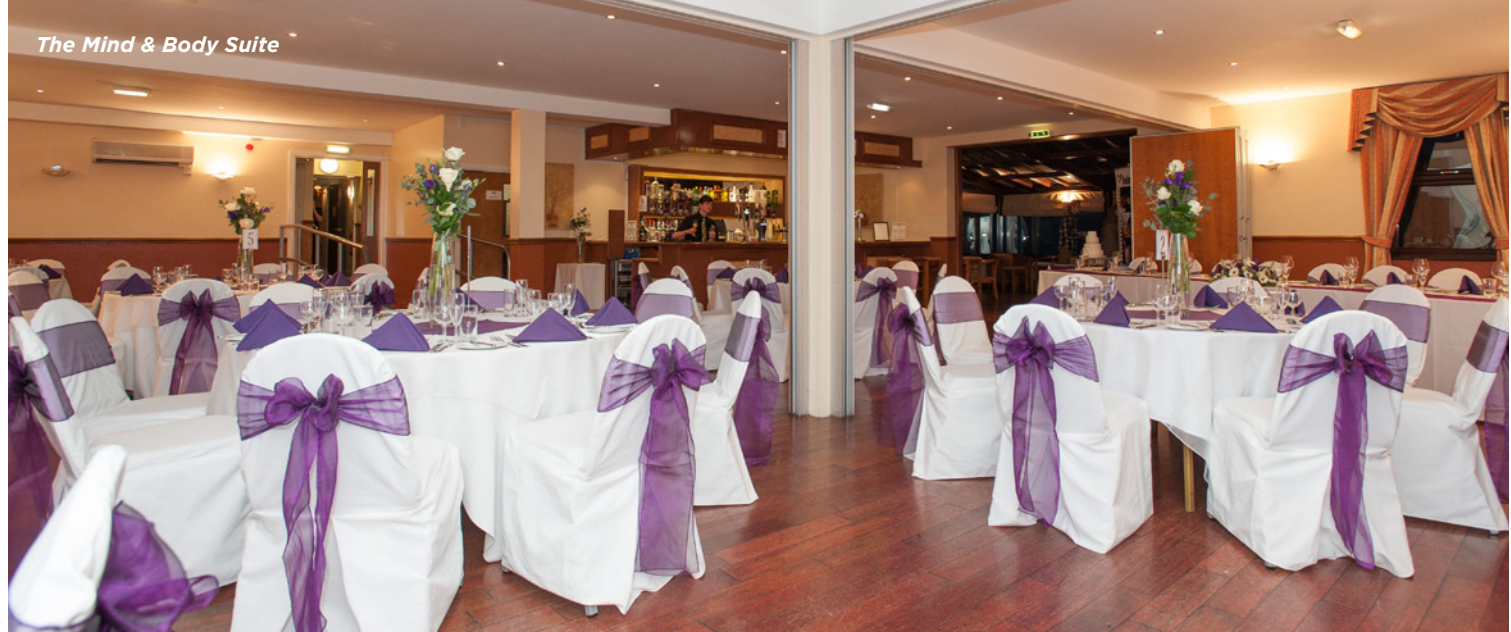
The Mind & Body Suite

Both of our function rooms are spacious, fully air-conditioned and have their own private bars.