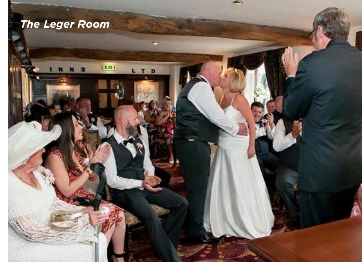
The Leger Room