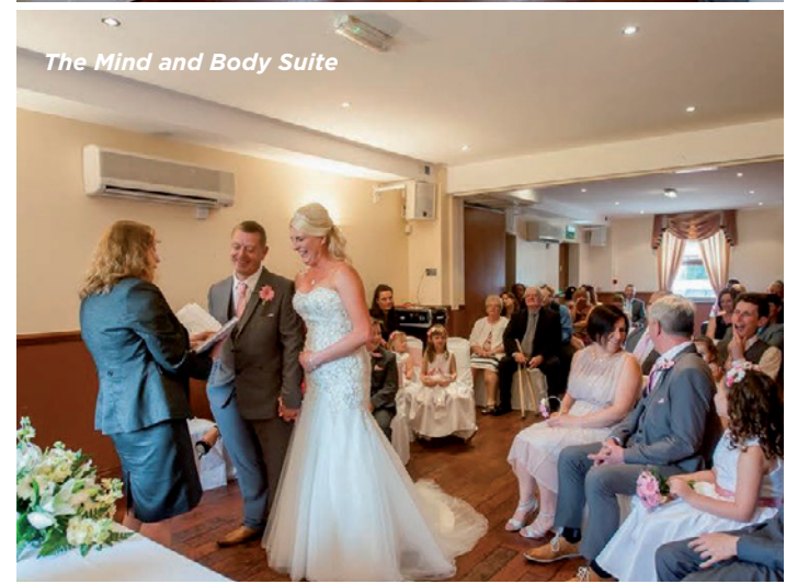
The Mind and Body Suite