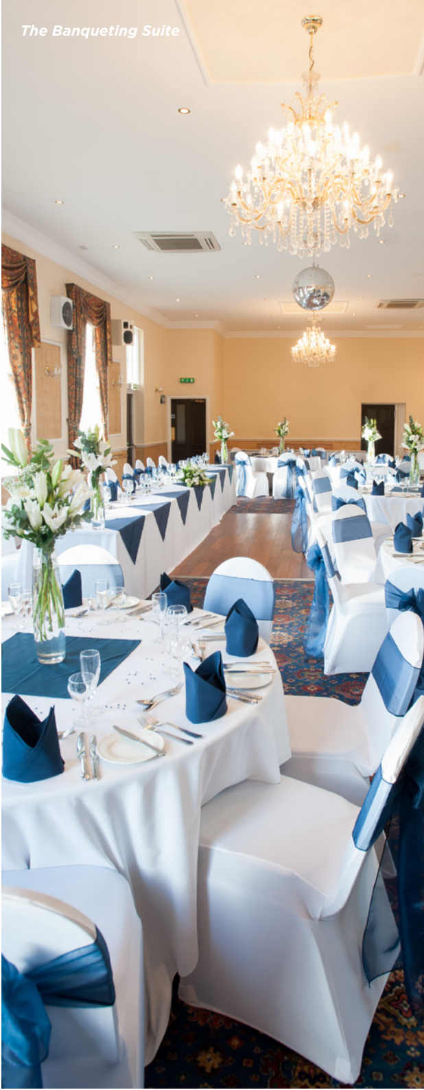
The Banqueting Suite